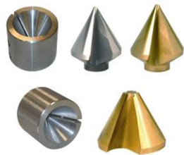
Special HSS deburring tools