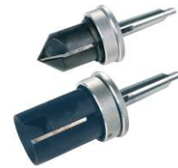
Deburring tools with adjustable depth stop